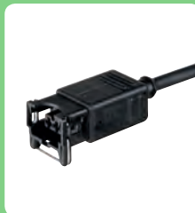
Double Valve Plug